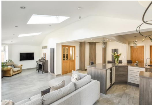
Five Beds / Three Baths