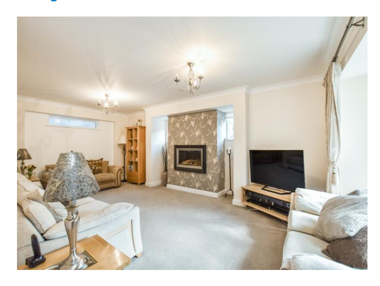
Home Office / Sitting Room