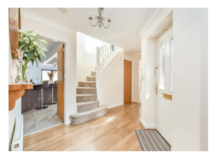
Cloakroom / WC 6' 10" x 3' 6" (2.08m x 1.07m) Lounge 19' 9" x 11' 8" + recess (6.02m x 3.55m)