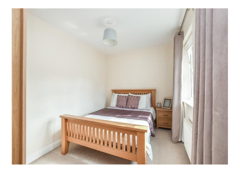
Bedroom Five 8' 1" x 7' 10" (2.46m x 2.39m)